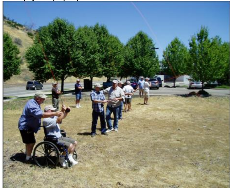
STFF Spey Fest, 6/09/2012