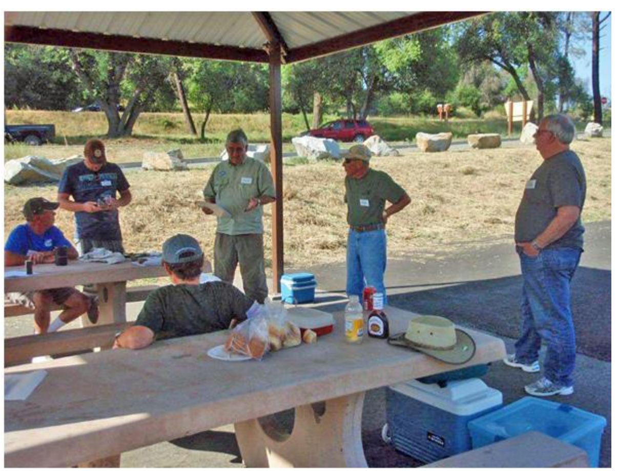
Clear Creek Evening Fishout, 5/15/2012