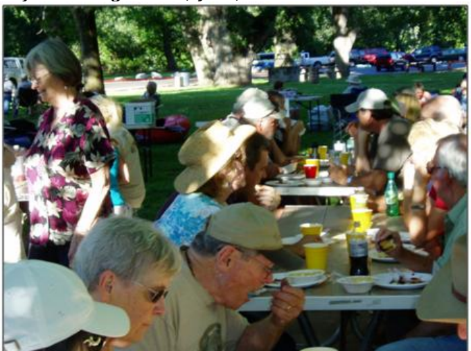
Project Healing Waters, June, 2012