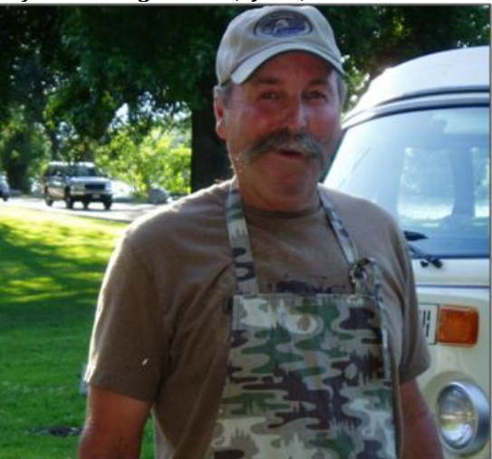
STFF Annual Barbeque Chef, 6/13/2012