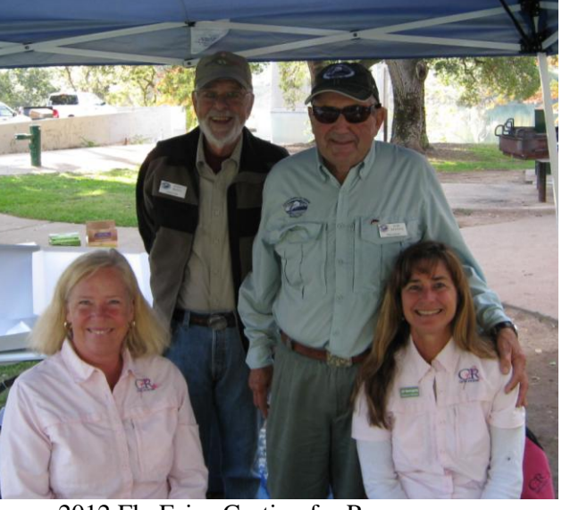
2012 Fly Fair - Casting for Recovery