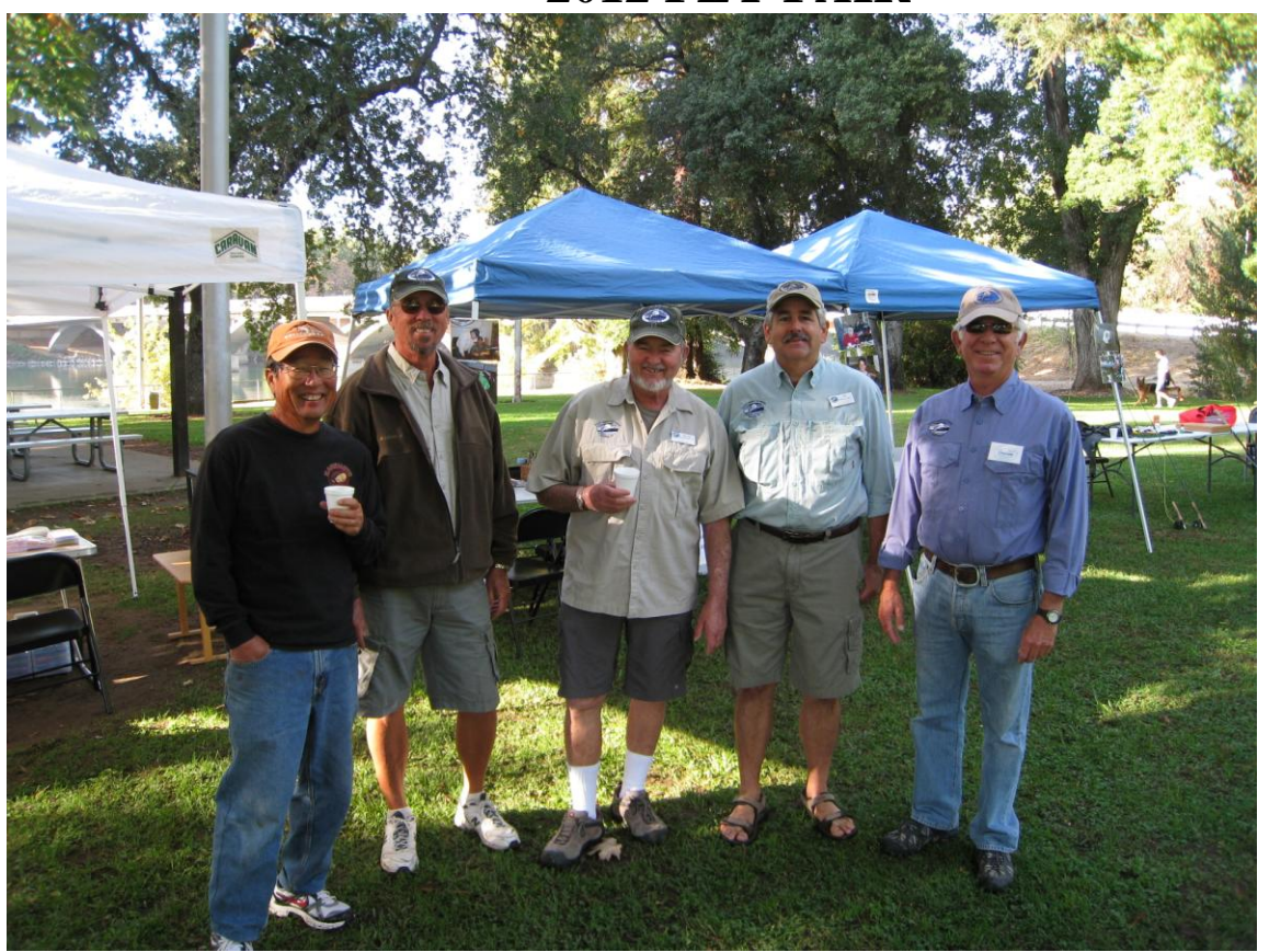
2012 Fly Fair Setting Up