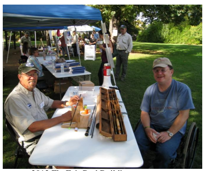
2012 Fly Fair Rod Building