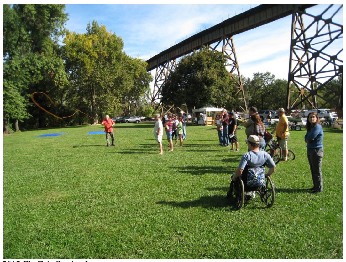
2012 Fly Fair Casting Lessons