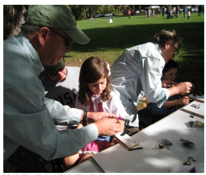
2012 Fly Fair - Kids Fly Tying