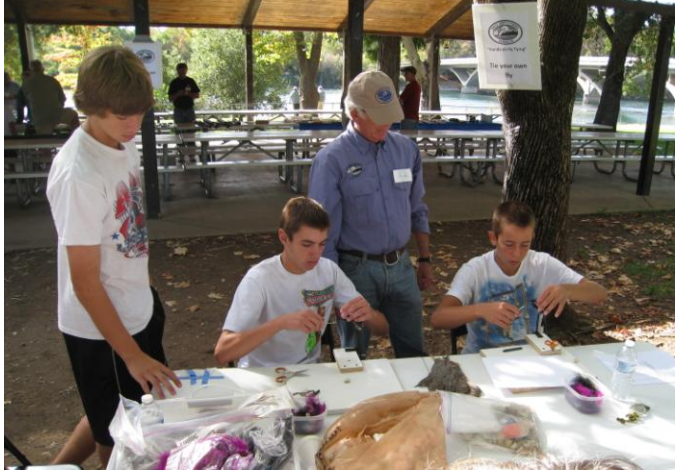
2012 Fly Fair - Kids Fly Tying