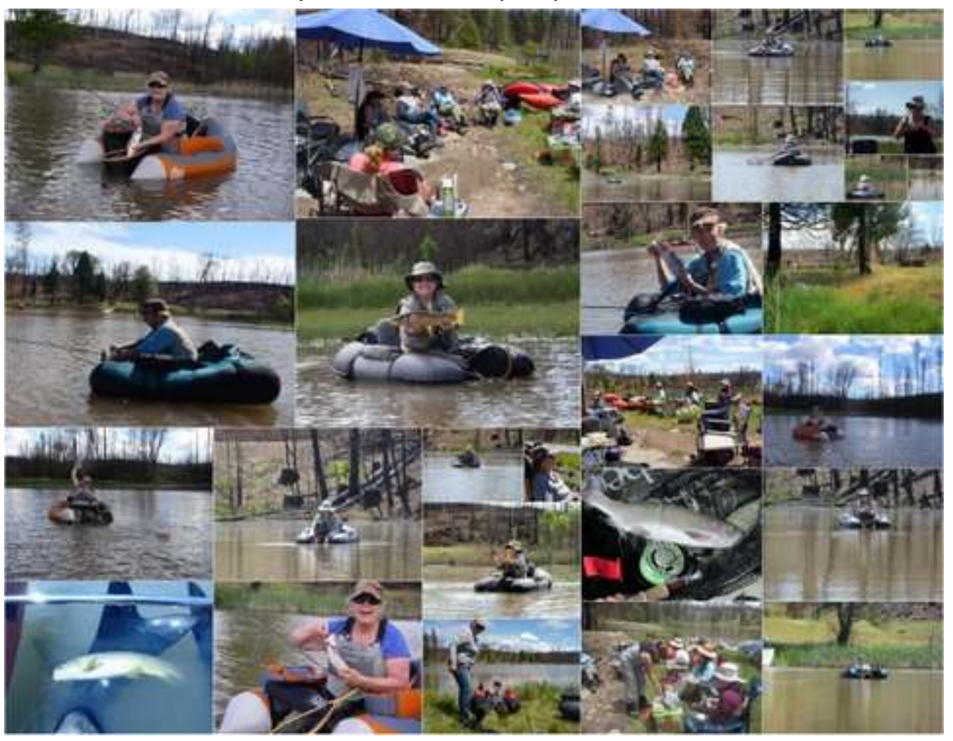
Photo Collage of the 2013 Lake Christine Mayflies Outing Fundraiser 5/18/2013

Project Healing Waters Fund Raising Event Saturday, July 20<sup>th</sup>