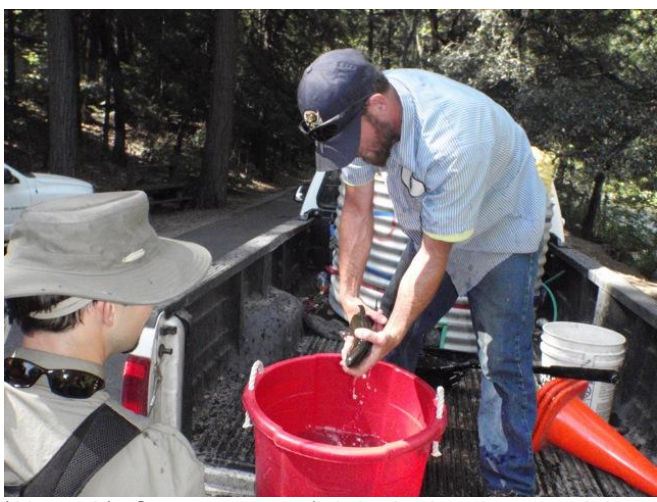
(Above L) Our request to fish in the hatchery truck barrel was denied!