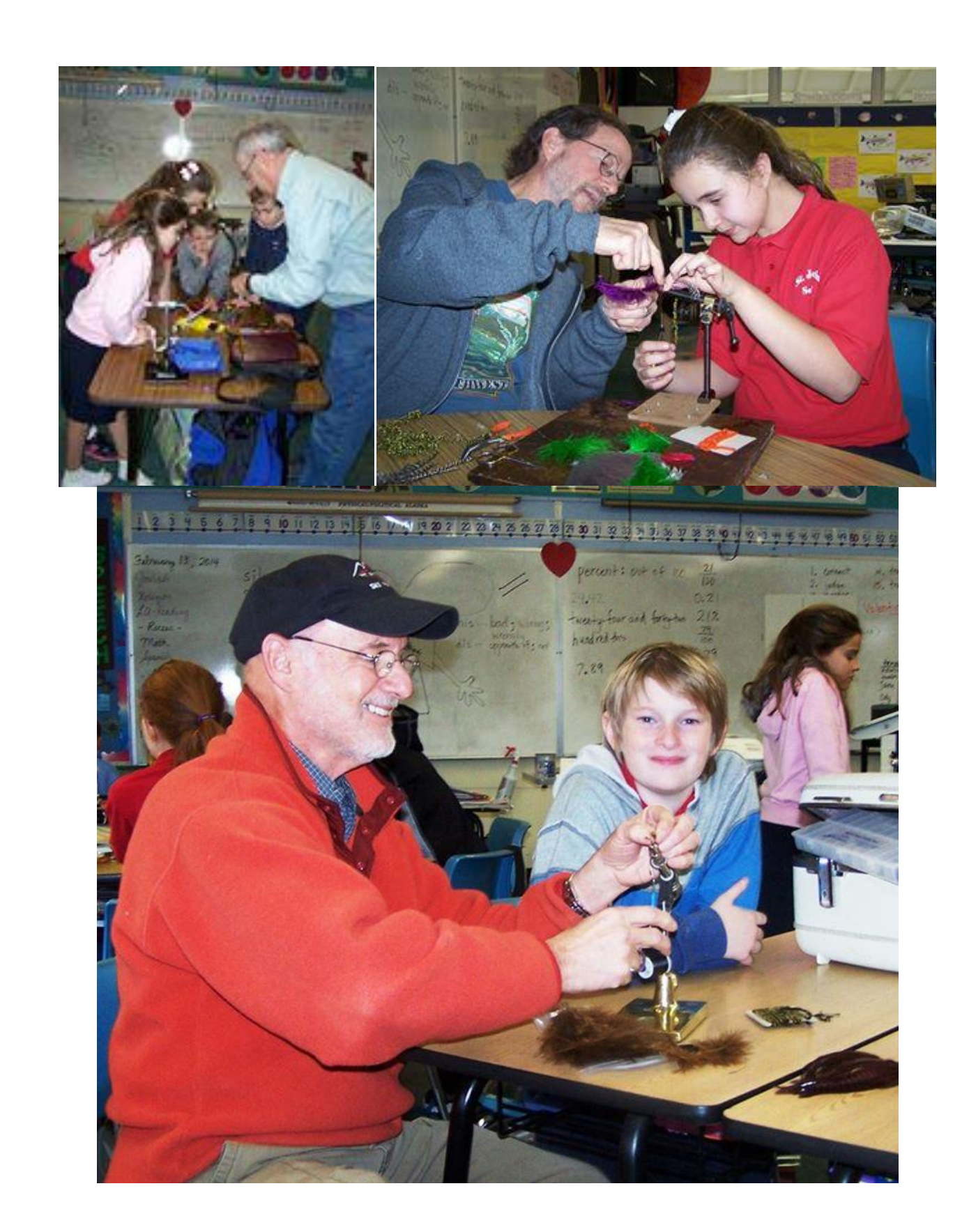
Teaching the Fine Art of Fly Fishing (page 3 of 3)